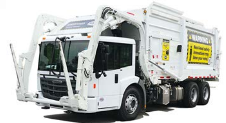
Available with articulating arms for EonicSD™ chassis