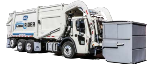
Optimized Weight LowRider body package