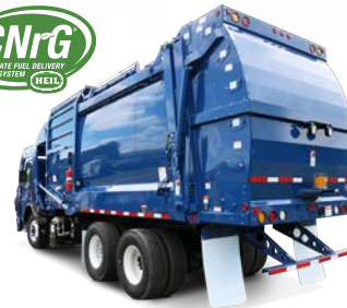
Available with optional CNrG® Tailgate