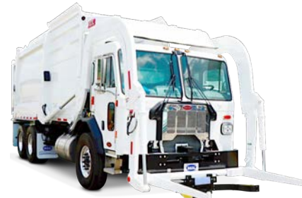
Available with Curotto-Can commercial grabbers